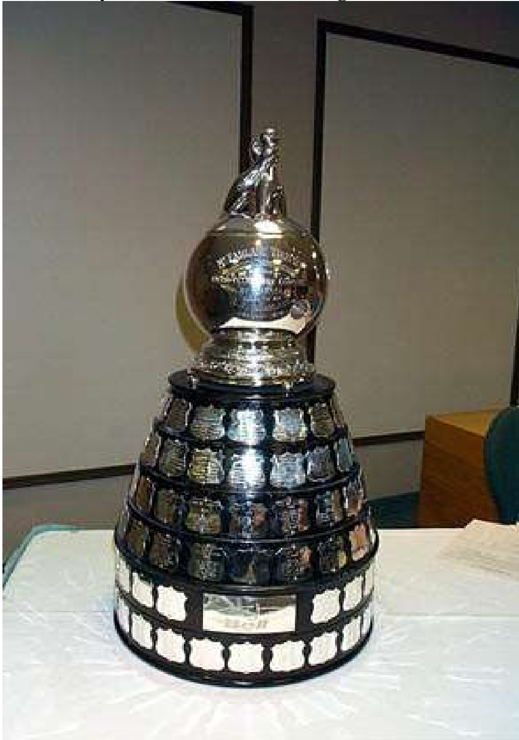
McFarlane Bowling Trophy Le Trophée de Quilles McFarlane