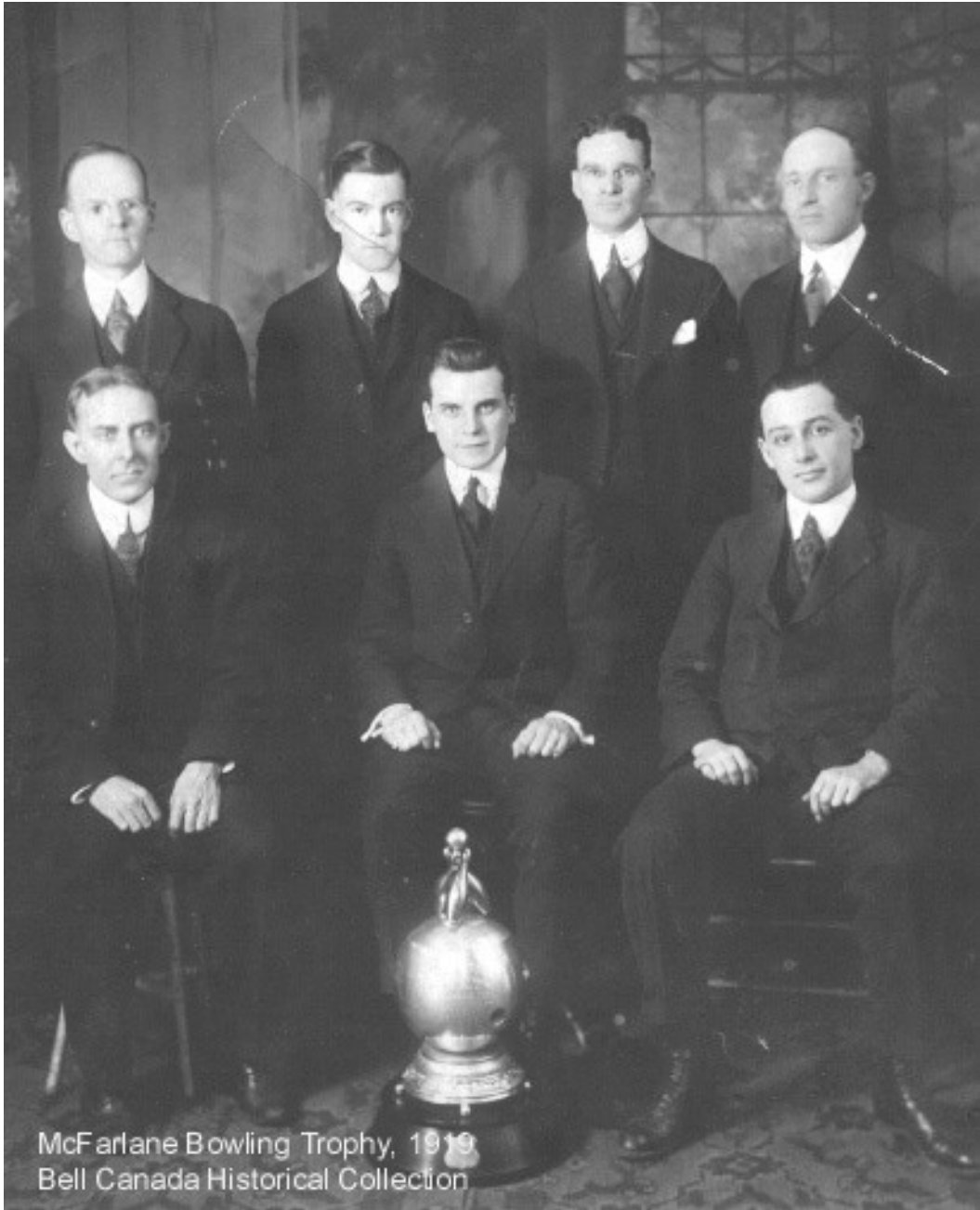
McFarlane Bowling Trophy, 1919 Bell Canada Historical Collection